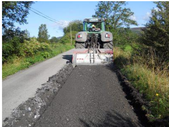
Crushing of road materials, with single lane traffic maintained

“Roadteam provide customers with 60% cheaper, 70% greener and 80% faster solutions to road repairs”