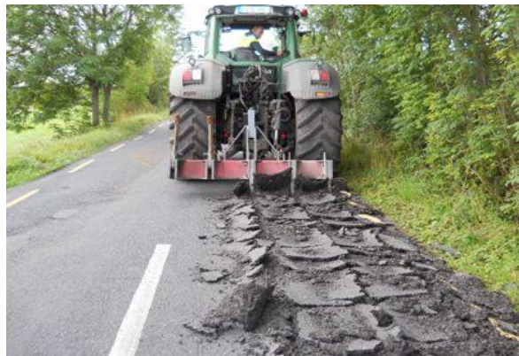
Road being prepared for crushing.